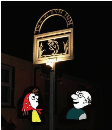
IT'S WALES'S ANSWER TO THE ANGEL OF THE NORTH

Next edition will be published at the end of September 2011. Last date for submission for inclusion is Saturday 16th.